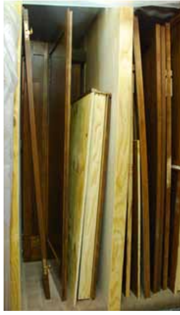
The finished wardrobe in storage. OCC returns original pieces to service, or makes new pieces as needed to accommodate changing office needs.