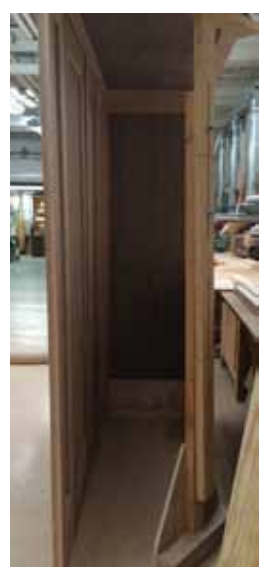
Above, the new wardrobe cabinet is narrower than an original to fit neatly behind the door in the Lt. Governor's office.