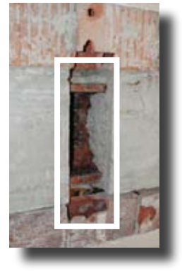
Steel beam uncovered, above. Slotted plate added for stability, below.

the Capitol Commission will be able to reference the original stencil macquette, as future restoration uncovers the hidden beauty of the Nebraska State Library's Reading Room.