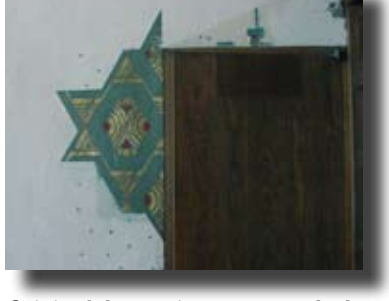
Original decoration uncovered, above.

and organize the collections a discovery was made--the original stencil pattern for the decoration of the Reading Room wall. In the mid 1990's with this newly discovered information in hand, OCC hired a conservator to investigate. His work