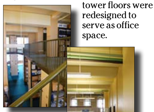
Book stacks on seventh floor, above, were replaced with offices on other tower floors.

s the Nebraska State Capitol was \mathbf{1} being designed in the early 1920's, architect Bertram Goodhue made specific provisions for the State Law Library. Regarding his artistic vision for the Capitol Goodhue stated, "Though everywhere monumental, no element of the practical or convenient has been sacrificed to this end. Even the tower is no mere useless ornament, for its shaft contains the glass-floored, many storied Library book stack." After construction was underway, the Nebraska Capitol Commission realized the Law Library would not need all the tower space. While the 7th floor was built to include the glass floored book stacks, other