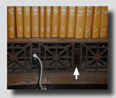
stack space. Using the radiator's back side, which had not been over-painted, and uncovering original colors on picture molding, staff determined the original accent color. Using standard color swatches found compatible colors. The radiators, picture molding, walls, and ceilings were repainted back to the architects original color scheme, as shown above.

Two new outlets were located in bookshelves and are unnoticed except when in use, left.