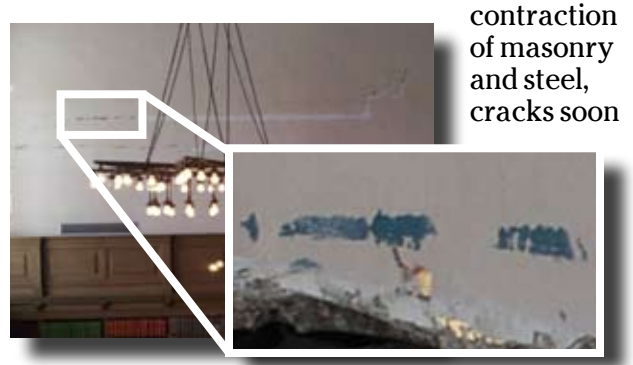
Damaged plaster reveals a hint of color and what might be a decorative finish.

apitol Architect Bertram Goodhue's use of historic and modern building techniques to create beautiful rooms in the Capitol is evident in the State Library's Reading Room. The Reading Room appears to be a limestone box with a walnut beamed ceiling and three large windows in one wall. Such masonry construction would be unstable if not for the steel beams holding the structure together, steel beams hidden behind masonry during construction. With seasonal changes causing expansion and