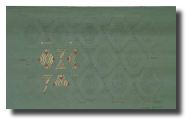
Research in the Capitol Collection by the Capitol Archivist uncovered the original stencil macquette for the decorative walls in the Law Library's Reading Room.

Noticing bits of gold and color in the cracked plaster on the wall, Office of the Capitol Commission staff suspected there was a decorative finish hidden beneath the paint. But other restoration work in the Capitol took precedence. Once OCC hired a full time archivist to investigate