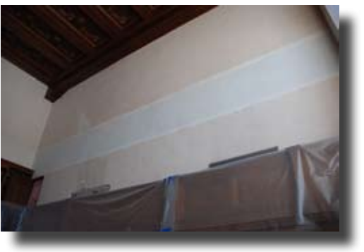
Plaster repair, above, covering the stabilized wall support beam will be monitored to gauge success of repair.