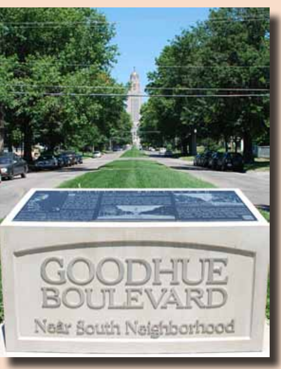
Architect Bertram Goodhue was honored when the City of Lincoln renamed 15th Street south of the Capitol. As Goodhue envisioned, the Capitol is the dominant feature looking north from A Street.

ince Nebraska's Capitol was completed in 1932, the "Tower on the Plains" has been a dominate feature of Lincoln's skyline. In his program statement, Goodhue recognized, "The site is a square in the heart of the city of Lincoln, the point of intersection of two great avenues; while the surrounding country is generally level." He understood the importance of the site and how to use it to create a landmark seen throughout the city and beyond.