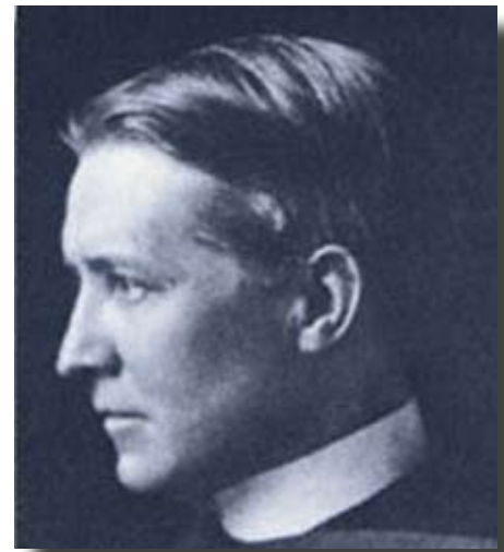
Capitol Architect Bertram Grosvenor Goodhue, 1869-1924

Nebraska State Capitol Seventh Floor 1445 K Street P.O. Box 94696 Lincoln, Nebraska 68509-4696 www.capitol.org 402.471.6691