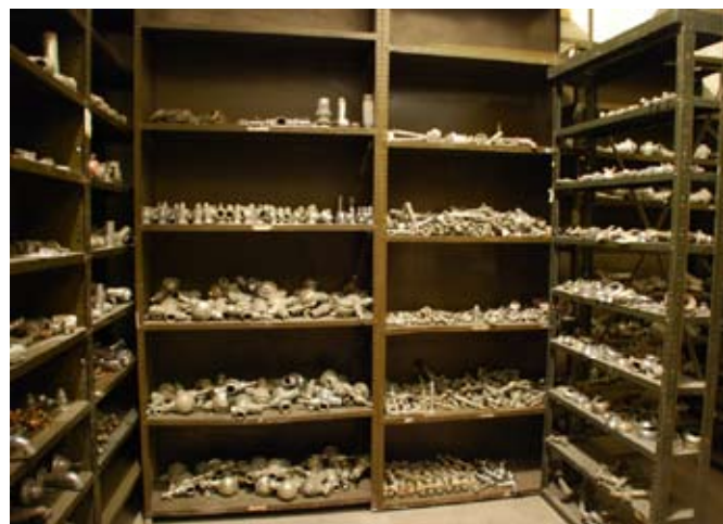
Original components of Capitol fixtures in storage and available for replacement and repairs.