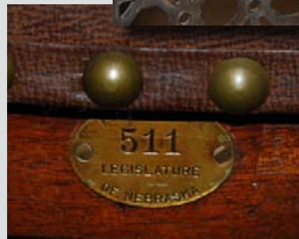
Above, original labels on Capitol original furniture. Below, original inventory tags help identify original Capitol pieces.