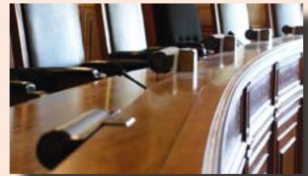
In the foreground a lamp as originally mounted to the Supreme Court bench. Beyond, new lamp bases elevate the original lamps to provide more light to the bench.

The Office of the Capitol Commission faced a similar challenge in the Supreme Court. The original built-in lights on the Justices' Bench weren't meeting current needs. Small supplemental desk lamps had been brought in for additional light. As part of on-going Capitol restoration work a design was developed to utilize the original lamps in a new way. Roger created a new lamp base to elevate the original lamps for re-use. The non-original desk lamps were removed and the original lamps returned to service.