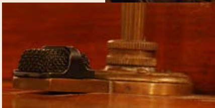
The Warner Chamber with new technology. Inset, the new microphone fitted to use existing holes and hardware.

accommodate video conferences and interactive programs. The goal of the project was to add the system in the least invasive manner. The large box holding the projection equipment, while made the same color as the limestone, is intrusive. The boundary microphones on the desks, however, are easy to miss. In a video conference or panel discussion the audience comments are important. Audience microphones were added without visual or physical impact on the room. Roger developed a small metal platform for the microphones which used the same routing as the electrical wires feeding the desk lamps. The microphones were added without the need to drill new holes in the original desks. About that same time the senators of Nebraska's Unicameral Legislature were provided with lap top computers to take the place of