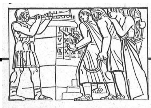
The Publishing of the Twelve Tablets in Rome (c. 450 BC) - In the third century of Rome, the polity had changed, and when it appeared the Laws had been sufficiently amended, in light of opinions expressed, the Laws were adopted, and formed the basis of all public and private law.