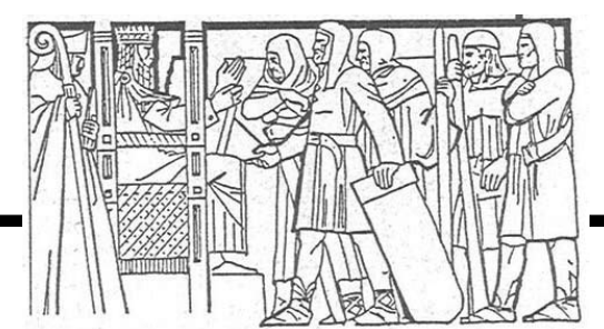
The Codification of Anglo-Saxon Law under Ethelbert (c. 600) - Following the example of Justinian, King Ethelbert organized existing customs and practices into the first code of law written in English.