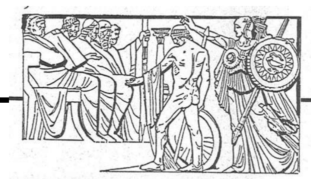
Orestes Before the Areopagites (play written and performed in 458 BC) - A scene from Aeschylus' Eumenides documenting an event which created the institution of the jury and abolished the requirement of blood revenge.