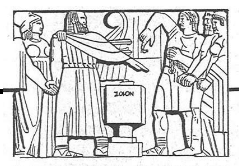
Solon Giving A New Constitution to Athens (c. 570 BC) - Solon was of all men not implicated in the troubles of Athens, he was empowered to be an arbitrator and lawgiver; the rich consenting because he was wealthy, the poor because he was honest.