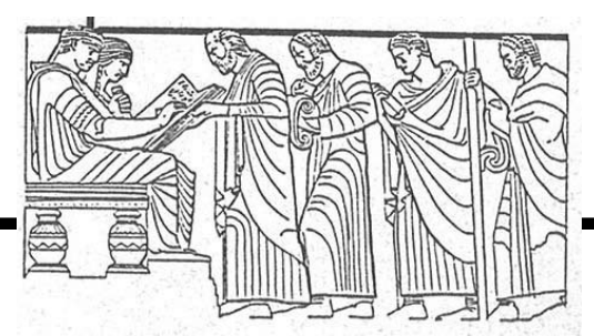
The Codification of Roman Law Under Justinian (c. 560) - Justinian's codification of all of Roman law is significant in its preservation of the idea that a law is regarded as an obligation assumed voluntarily by the people.