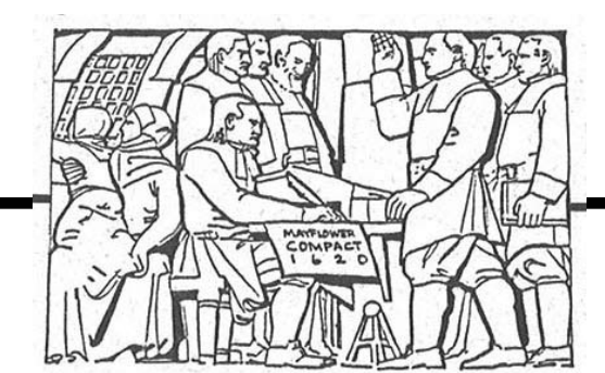
The Signing of the Pilgrim Compact on the Mayflower (1620) - Before setting foot in a new land, the Pilgrims agree to establish a civic body politic to better order and preserve the good of the colony.

These two relief carvings on the outside of the Nebraska State Capitol represent the foundations of the legislative branch in events that occured in past civilizations. Modern governments and citizens can learn from how people lived and governed themselves in the past.