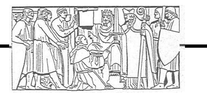
The Magna Carta (1210)- The Magna Carta is cited as the basis for Anglo-Saxon law, limiting the powers of the King and granting liberties to free men.

These two relief carvings on the outside of the Nebraska State Capitol represent the foundations of the executive branch in events that occured in past civilizations. Modern governments and citizens can learn from how people lived and governed themselves in the past.